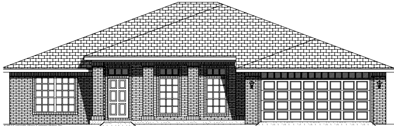
ELEVATION BBF ELEVATION BB