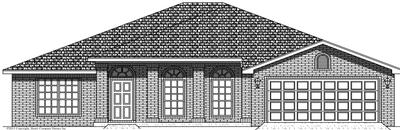
ELEVATION ABF ELEVATION AB