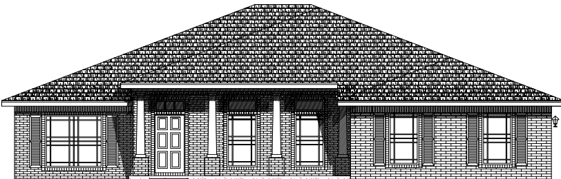
SIDE ENTRY ELEVATION ZB